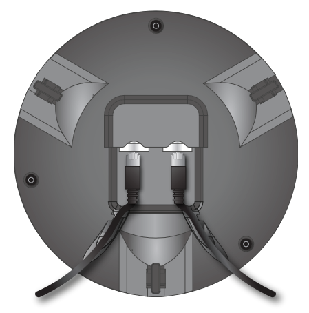
both available ports can be used as input or output indifferently.

If the POD must be connected to a XT4000 Series endpoint or XT Executive 240, the procedure is as follows.