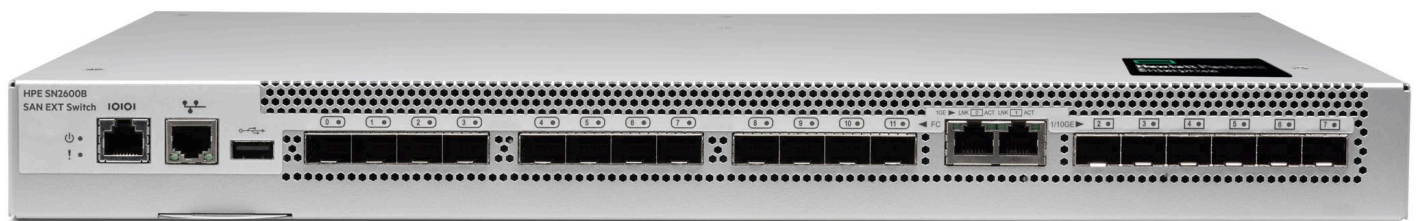
HPE Storage SAN Extension Switch B-series SN2600B

The HPE Storage SAN Extension Switch B-series SN2600B base configuration provides four 32 Gb/s-capable Fibre Channel ports and two 1GbE Ethernet ports with Adaptive Rate Limiting (ARL) and encryption (IPsec). The on-demand upgrade license enables all 12 Fibre Channel ports, 10Gb FCIP/FC, Fabric Vision technology, Extension Trunking, Fibre Channel Trunking, and Integrated Routing (FCR). The full configuration is a comprehensive bundle enabling all ports and includes Brocade Fabric Vision technology, Extension Trunking, Fibre Channel Trunking, ARL, IPsec, and Integrated Routing.