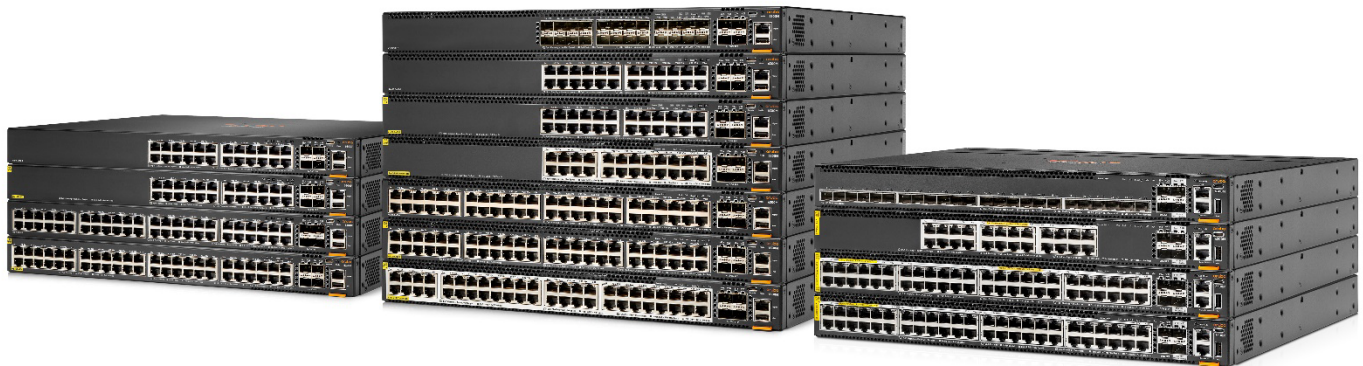
HPE Aruba Networking CX 6300 Switch Series

HPE Aruba Networking Dynamic Segmentation extends HPE Aruba Networking's foundational wireless role-based policy capability to HPE Aruba Networking wired switches. What this means is that the same security, user experience and simplified IT management can be enjoyed throughout the network. Regardless of how users and IoT devices connect, consistent policies are enforced across wired and wireless networks, keeping traffic secure and separate.