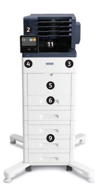
Xerox® VersaLink® C600 Color Printer