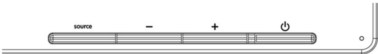
HP ZR2740w Bezel Buttons