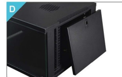
Removable side panels simplify your installation of accessories and IT equipment.