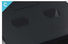
120mm*120mm fans can be install on the top cover (not included)