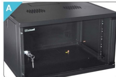
Turning angle of the front door is over 180 degrees.