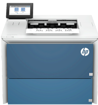
HP LaserJet Enterprise 6501dn Printer

This printer is intended to work only with cartridges that have a new or reused HP chip, and it uses dynamic security measures to block cartridges using a non-HP chip. Periodic firmware updates will maintain the effectiveness of these measures and block cartridges that previously worked. A reused HP chip enables the use of reused, remanufactured, and refilled cartridges. More at: http://www.hp.com/learn/ds