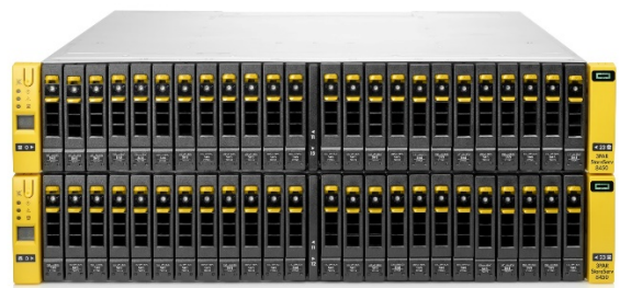
HPE 3PAR StoreServ 8000 Storage (4-Node Storage Base)