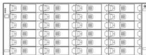
HPE 3PAR StoreServ 8000 SFF(2.5in) SAS Drive Enclosure