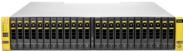
HPE 3PAR StoreServ 8000 Storage (2-Node Storage Base)

HPE 3PAR StoreServ 8000 is storage made effortless.