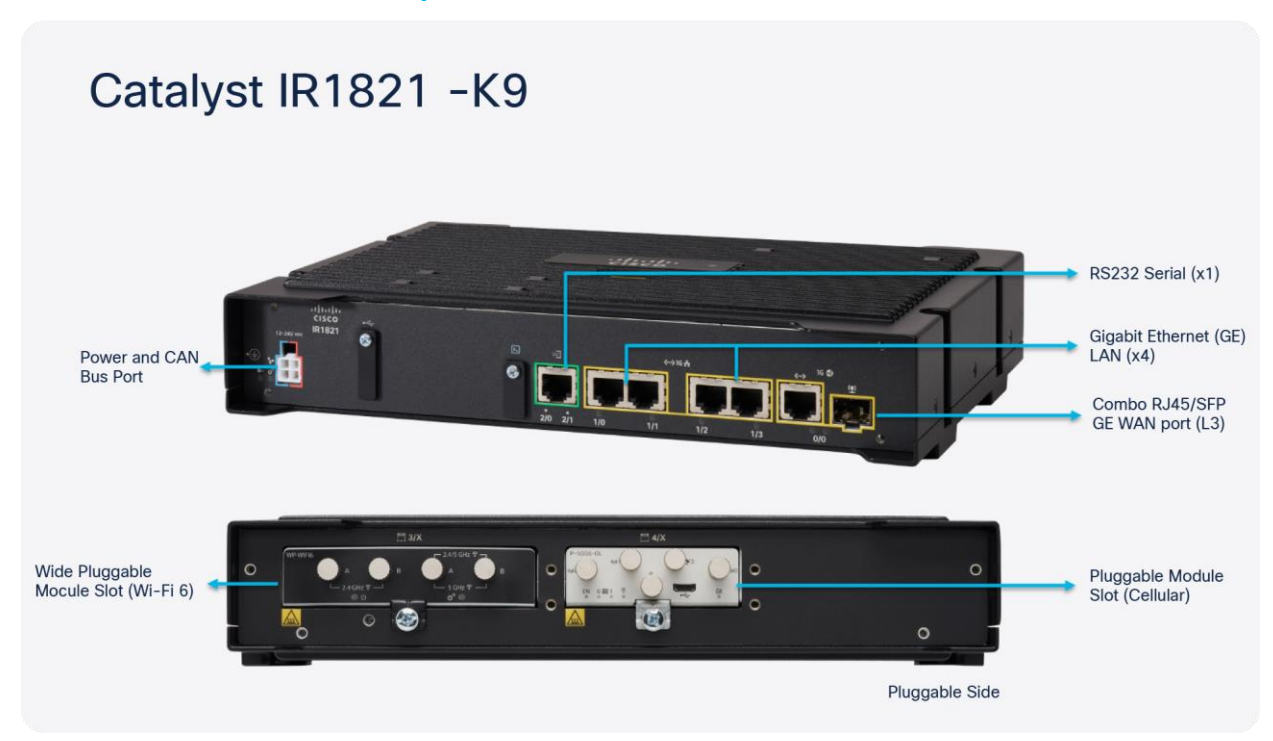
Figure 3. IR1821-K9 interface ports