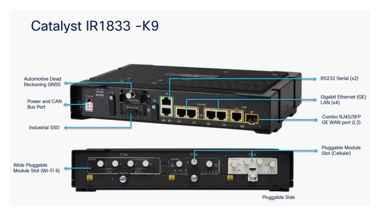
Figure 5. IR1833-K9 interface ports