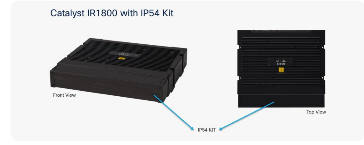
Figure 10. Catalyst IR1800 with IP54 kit

The IR1800 Series is IP40 rated by design. This IP rating can further be improved to IP54 with an additional IP54 kit (IR1800-IP54-KIT).