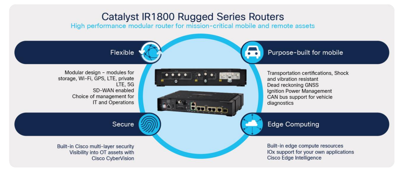
Figure 1. Product Highlights

The IR1800 Series is built to withstand the harsh environments found in transportation, public safety, and oil and gas applications. Automotive certifications and features such as Controller Area Network (CAN) bus support, dead reckoning and Global Navigation Satellite System (GNSS), and ignition power management make it ideal for secure, reliable connectivity in transit and public safety applications, including first responder vehicles, passenger fleets, service fleets, and commercial truck fleets.