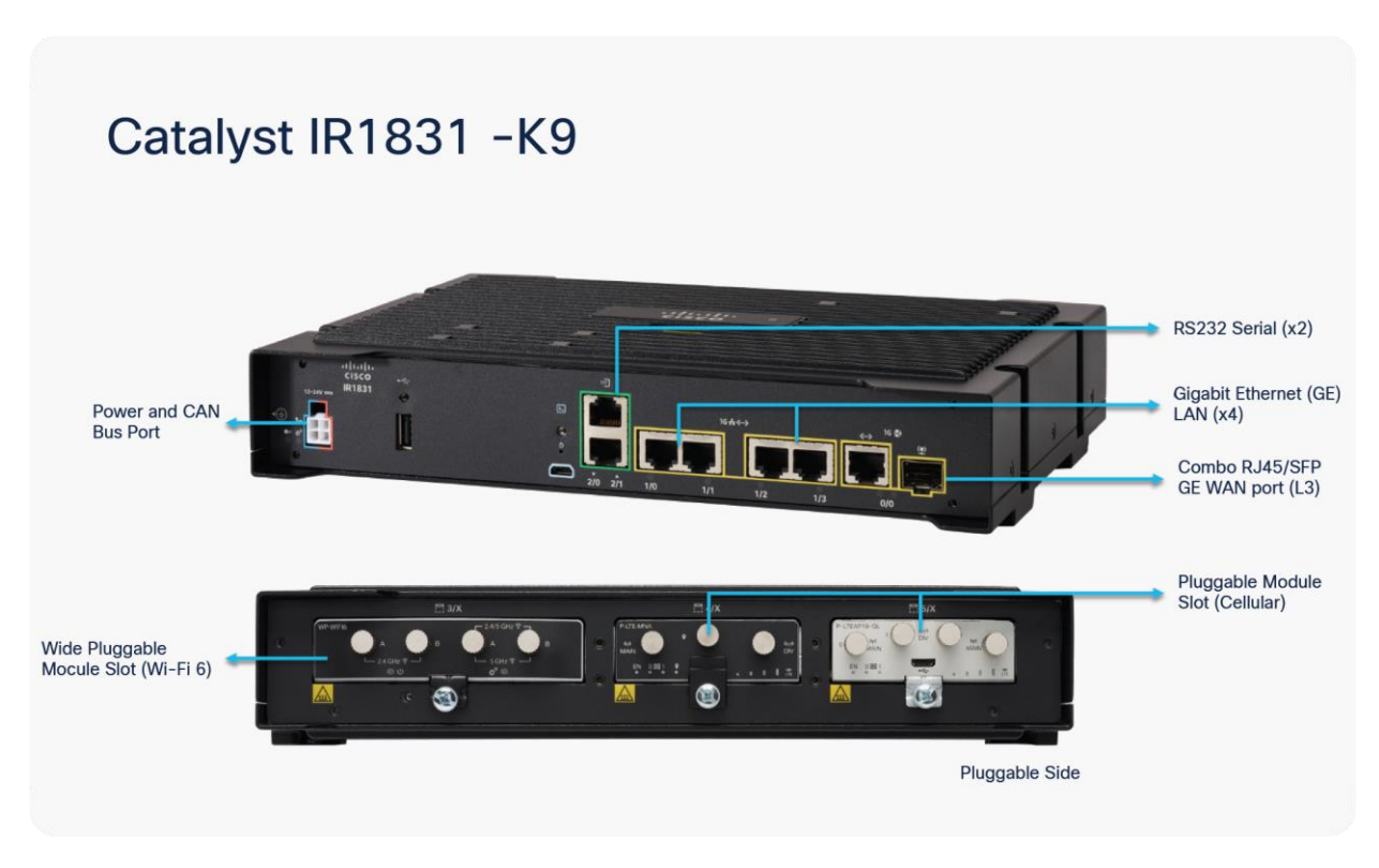
Figure 4. IR1831-K9 interface ports