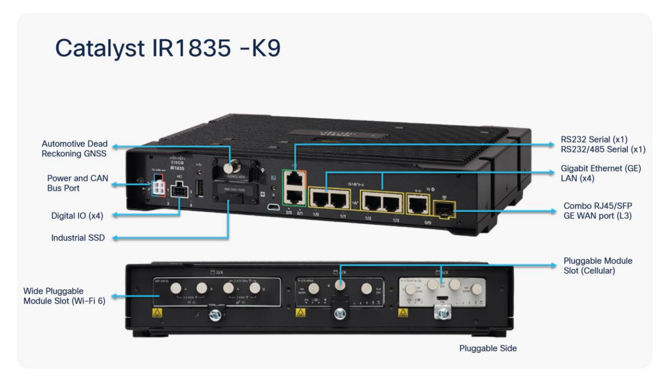
Figure 6. IR1835-K9 interface ports