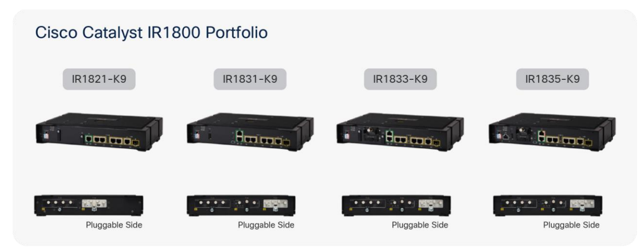
Figure 2. Models in the Catalyst IR1800 Series

Cisco Catalyst IR1800 Rugged Series Routers are best-in-class ruggedized routers designed for assets that are mobile or on the move, stationary or remote. These highly flexible and modular routers are 5G ready and adopt the latest Wi-Fi 6 standards. The IR1800 Series consists of four models: IR1821-K9, IR1831-K9, IR1833-K9, and IR1835-K9.