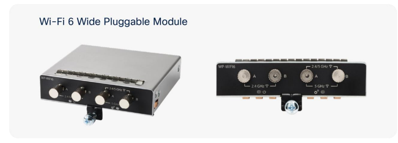
Figure 8. Wi-Fi 6 wide pluggable module

The Catalyst IR1800 Series also introduces Wi-Fi 6 in a pluggable form factor.<sup>1</sup> This ruggedized wide pluggable module provides the latest in Wi-Fi technology and is compatible with the latest wireless controllers from Cisco. The module can run in Control and Provisioning of Wireless Access Points (CAPWAP) mode and Embedded Wireless Controller (EWC) mode, as well as Work Group Bridge (WGB) mode.