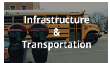
Infrastructure & Transportation

Integrate sensors and thirdparty devices over the RS-485 serial port to provide seamless connectivity to IP networks