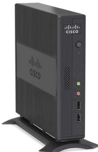
Figure 1. Cisco Virtualization Experience Client 6215

Cisco VXC 6215 is ideal for many work environments such as contact centers, shared workspaces, and telework environments. When Cisco VXC is delivered with Cisco VXME, users are able to access secure virtual desktops with integrated voice and video.