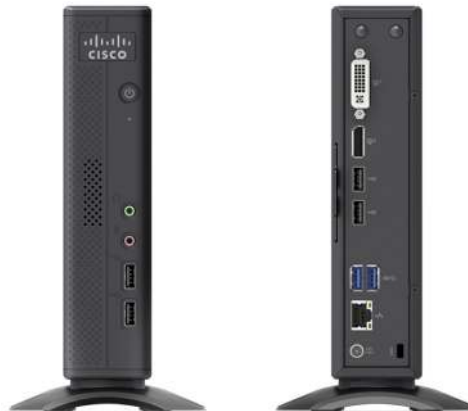
Table 1. Hardware Specifications