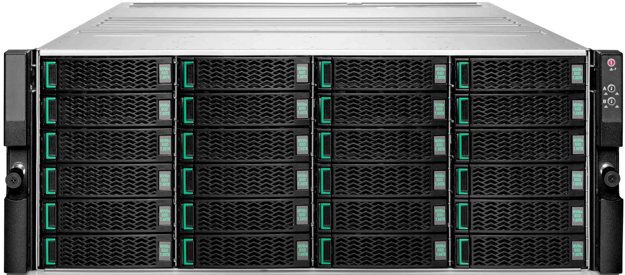
HPE Alletra Storage 6000 array (Base array, 4U; 24 bays with NVMe SSDs)