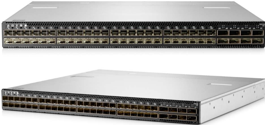
Figure 2: StoreFabric M-Series SN2410M