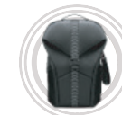
Legion 16" Functional Gaming Backpack GB700