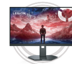
Legion 27Q-11 Gaming Monitor