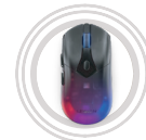
Legion M410 Wireless RGB Gaming Mouse