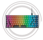
Legion K510 Mini Pro Gaming Keyboard