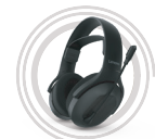
Legion H410 Wireless Gaming Headset