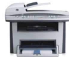
HP LaserJet 3055 AiO

Print, copy, and scan from one compact device