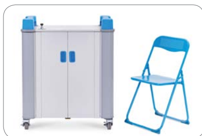
TabCabby 32H Compact