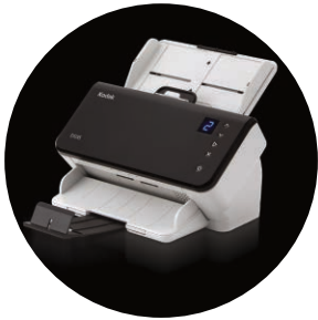
Kodak E1035 Scanner

* Throughput speed may vary depending on your choice of application software, operating system, PC and selected image processing features.