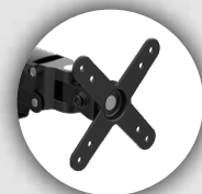
VESA 75x75 or 100x100 Compatibility

**Enclosure for Illustration only and not Included