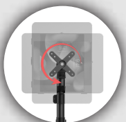
Portrait / Landscape Orientation