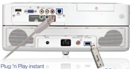
USB Plug 'n Play instant setup for PCs