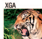
1024 x 768 Ensures sharper detail