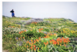
High color light output