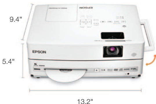
▲ Portable projector with DVD player