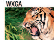
1280 x 800 Offers the highest quality and is ideal for widescreen (16:10 aspect ratio) display