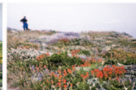
Low color light output

Actual photographs of images taken from two competing projectors run in default mode. Price, resolution and brightness (white light output) are the same for both projectors.