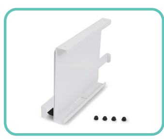
SV10 TABLET CONVERSION KIT, EASEL 98-003