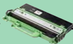
Waste Toner Box WT229CL