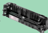
Fuser Unit FD-5000