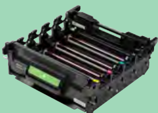
Drum Unit DR625CL