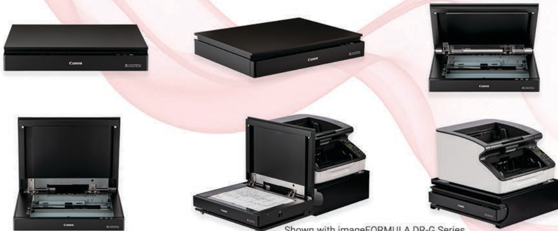
Shown with imageFORMULA DR-G Series Document Scanner and optional rack for FSU-202