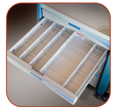
3" Drawer Dividers (Set of 2)