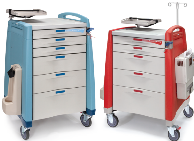
Blue Emergency Cart Standard Height Shown with Accessory Package 2 Red Emergency Cart Intermediate Height Shown with Accessory Package 3

The Avalo Emergency Cart is available in blue or red in three different heights. Choose a base cart in Standard, Intermediate or Compact height, then add a convenient accessory package to meet the workflow and storage requirements for your facility.