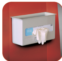
Single Glove Box