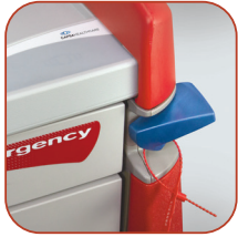
Tamper Evident Seals (100)