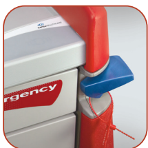
Tamper Evident Seals (100)