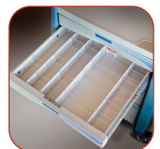
3" Drawer Dividers (Set of 2)