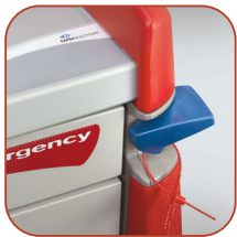
Tamper Evident Seals (100)