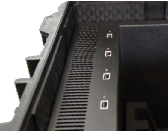
Charge progress LED indicator Indicateur LED de progression de charge