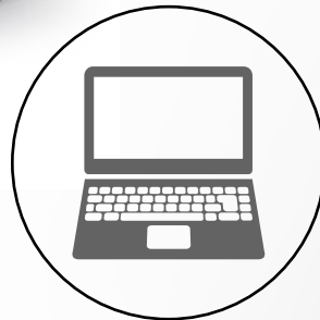
Notebook storage Emplacement notebook