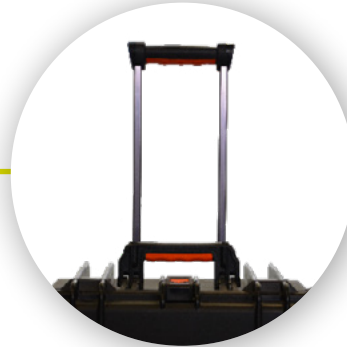
Bras de trolley extensible Extendable trolley arm