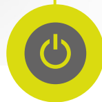
Individual LED charge progress indicators