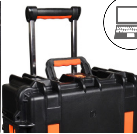
Extendable arm trolley Bras de trolley extensible