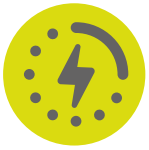
Smart charge Ports USB 5 volt