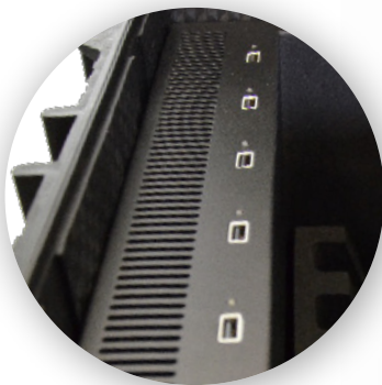
Individual LED indicators Indicateurs LED individuels