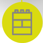
Preformed foam to accommodate 12 tablets