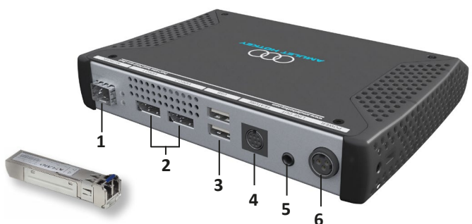
DXZC-M rear view. 1 Network port and SFP module. 2 Dual DisplayPort connectors. 3 Dual USB ports. 4 Feature connector. 5 Line level audio output. 6 DC power inlet.

TEMPEST versions of this product, approved to NATO SDIP-27 Level A and Level B by our TEMPEST-certified CESG and NATO partners, are available on special request. Contact Amulet Hotkey sales for more information.