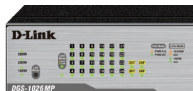
PoE usage LEDs

The DGS-1026MP features 24 10/100/1000BASE-T ports that support the IEEE 802.3at+ PoE standard. Each of the 24 PoE ports can supply up to 30 W, with a total PoE budget of 370 W, allowing users to attach multiple IEEE 802.3at-compliant devices to the DGS-1026MP without requiring additional power sources. Power over Ethernet is especially suitable for powering devices that are too far away from power outlets or for minimising the clutter of extra cables. The PoE usage LEDs further provide real-time feedback on the current PoE power usage on the network and helps plan out the PoE network budget, preventing PoE overloading problems.