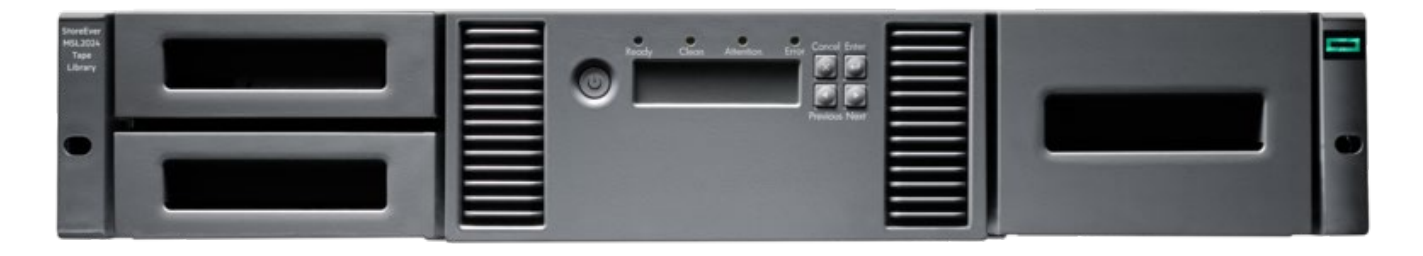
HPE Storage MSL2024 Tape Library

Quickly and simply manage the tape media both in and out of the library with the standard bar code reader, configurable mail slots, and removable magazines. If a tape were lost or stolen, protect important business data from unauthorized access with data encryption options. MSL investment protection and uncertain data growth are easily managed within the MSL library portfolio. Quickly increase capacity and/or performance with tool-free drive upgrades in the MSL2024 Tape Library or move tape drive kits to the MSL3040 or MSL6480 for library scalability and additional enterprise class features. Proactively receive detailed information about your MSL Tape Automation with HPE StoreEver TapeAssure Advanced, a licensed feature of CVTL. Information about the library, drives, and media are all monitored for utilization, operational performance, and life and health information. Prevent problems before they occur by proactively receiving notification if any library, drive or tape media parameters fall below Hewlett Packard Enterprise recommended standards.