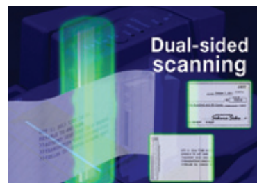
Two-sided scanning meets FSTC (IQA) and Check 21 standards

Epson's TM-S9000 features the fastest check scanning available with speeds up to 200 dpm and virtually trouble-free performance with a rating of 4.94 million Mean Cycles Between Failure.