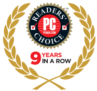
Canon Digital Cameras

PCMag.com Readers' Choice Award for Service & Reliability