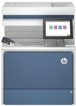
HP Color LaserJet Enterprise MFP 6800dn Printer

This printer is intended to work only with cartridges that have a new or reused HP chip, and it uses dynamic security measures to block cartridges using a non-HP chip. Periodic firmware updates will maintain the effectiveness of these measures and block cartridges that previously worked. A reused HP chip enables the use of reused, remanufactured, and refilled cartridges. More at: http://www.hp.com/learn/ds