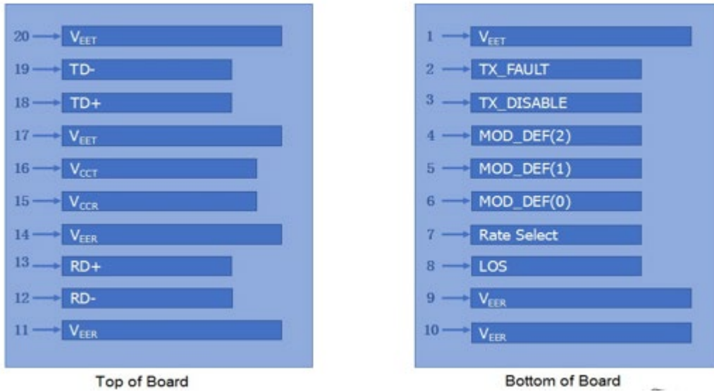
Pin-out of connector Block on Host board