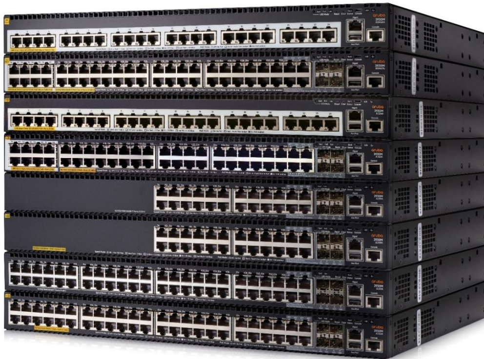
HPE Aruba Networking 2930M Switch Series

The HPE Aruba Networking 2930M Switch Series provides a simple and powerful access layer solution that can be quickly set up at branch offices with little or no IT support using Zero Touch Deployment. The switches include a Limited Lifetime Warranty.