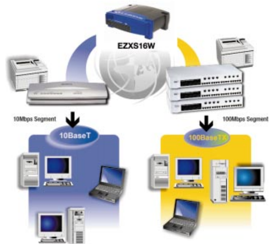
Configuration A (EZXS16W shown)

All of the workstations below can access all resources on the network - 10Mbps users can access the 100Mbps nodes, and vice versa. While allowing the 10Mbps and 100Mbps segments to communicate, the Switch optimizes data traffic by switching the data packets to their destination through the quickest route possible, which improves performance, even on the faster 100Mbps network segment.