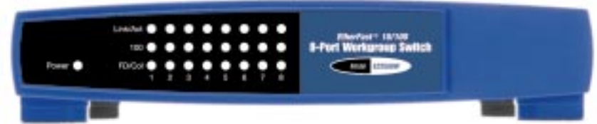
Front Panel - EtherFast 10/100 Workgroup Switch (EZXS88W v2 shown)

The chart below tells you what the front panel LEDs of the 10/100 Workgroup Switches mean. Each Switch has a Power LED on the left side to indicate when the unit is ON.