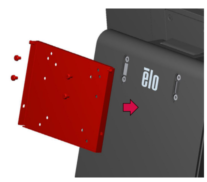
Attach the other bracket to the AiO system or monitor using the 4 M4 screws included in the kit.

Mount the wall bracket to the wall using 6 fasteners appropriate for the type of wall structure following all applicable building code standards.