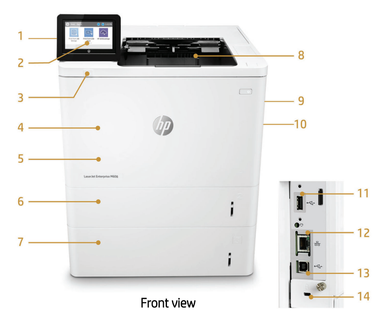
Close-up of I/O ports