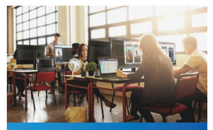
Increased device uptime Keep devices running smoothly and address repair issues quickly with efficient service and support that helps boost employee productivity.