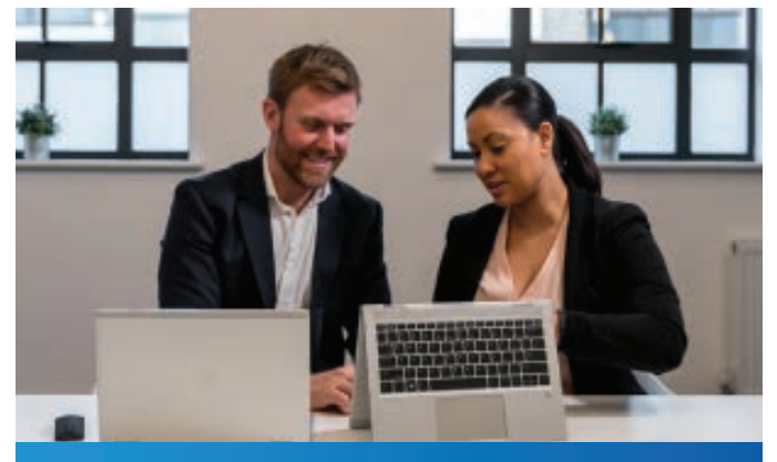
A team of HP experts by your side Ensure repairs are performed by those who know your devices best – HP Certified Technicians. Know your hardware is expertly serviced so you can free up time to focus on other IT priorities.