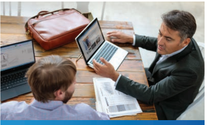
A proactive business approach No need to waste time finding suitable replacement parts, spending more money on urgent repairs, or leaving devices at service centres for weeks. Avoid surprises and rest easy knowing you're covered.