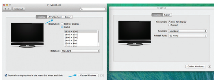
Using the Docking Station in Extended or Mirror Mode

The Display settings for each display will appear on the individual monitors themselves. To configure them all from a single location, press the "Gather Windows" button and each screen's Displays Preferences windows will appear on that display. All supported video resolutions will appear. To change the positioning of each display, click on the "Arrangement" button (found only on the primary display) and you can then virtually reposition each display.