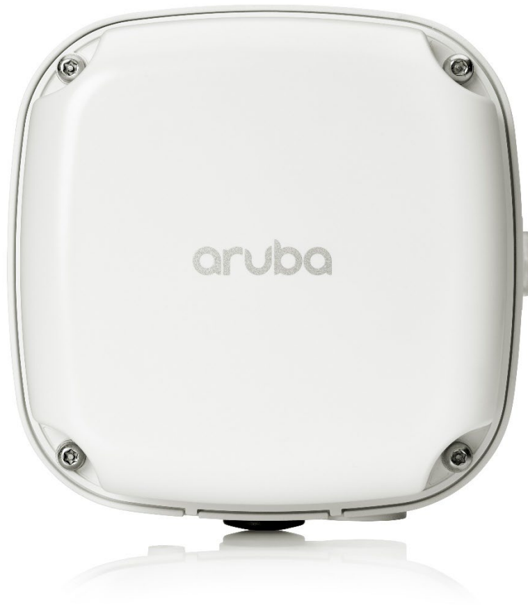
HPE Aruba Networking 560EX Series Hazardous Location Access Points

The HPE Aruba Networking advanced ClientMatch technology and an integrated Bluetooth beacon can help enable HPE Aruba Networking location services.