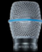
BETA 87A, BETA 87C