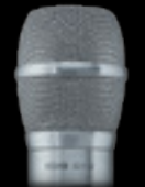
KSM9, KSM9HS (In Black or Nickel)

Also available with these Shure microphone cartridges