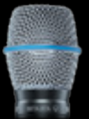
BETA 87A, BETA 87C