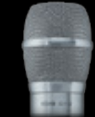
KSM9, KSM9HS (In Black or Nickel)

Also available with these Shure microphone cartridges