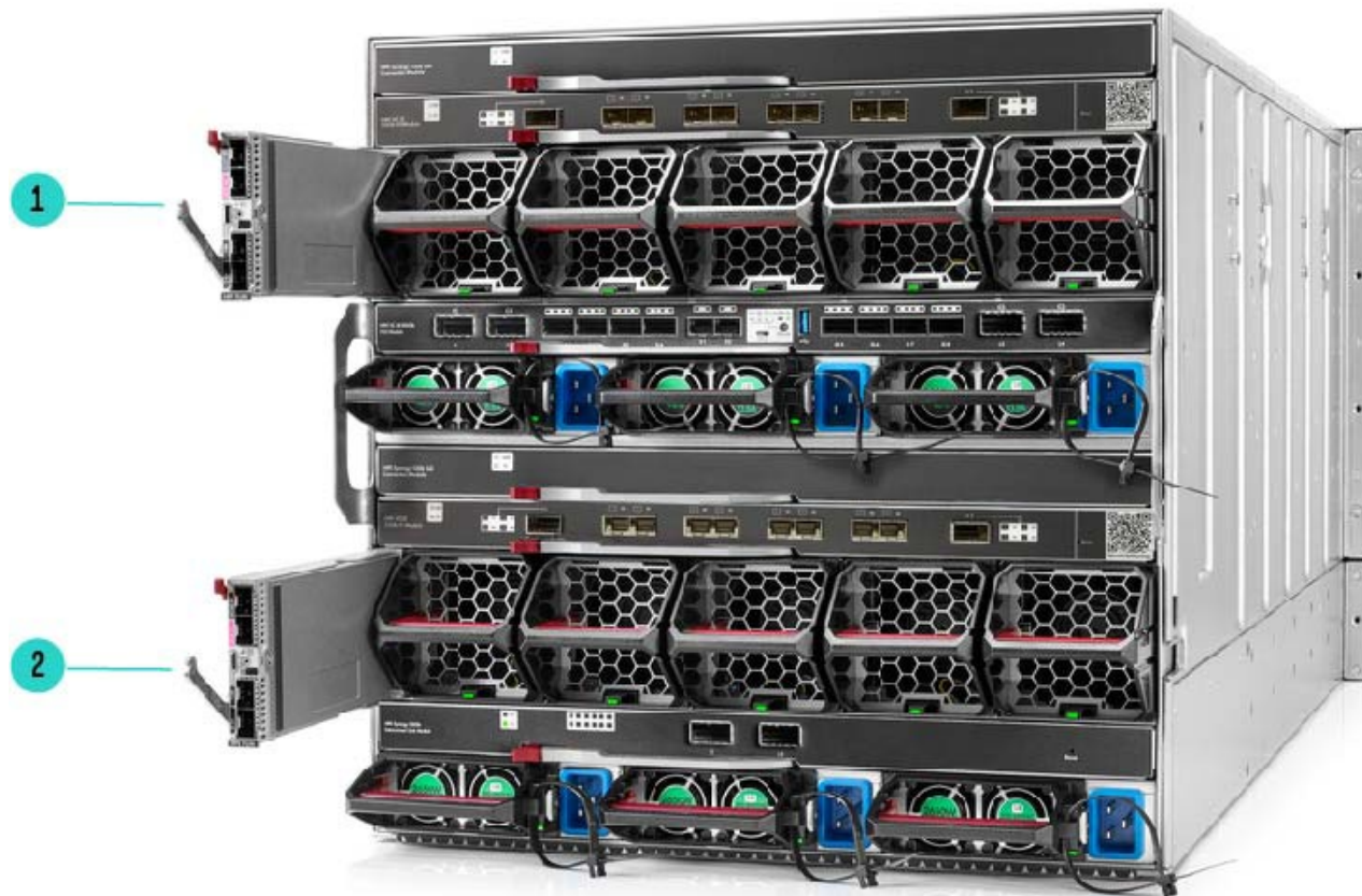
Figure 2: HPE Synergy 12000 Frame - Rear View (Frame Link Modules shown partially extended)