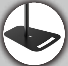
Sturdy Weighted Base