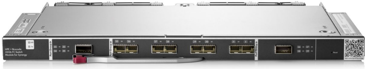
Brocade 32Gb Fibre Channel SAN Switch Module for HPE Synergy