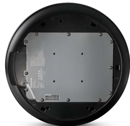
DCA901 Broadcast Microphone Array, Back