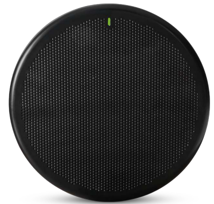
DCA901 Broadcast Microphone Array, Front