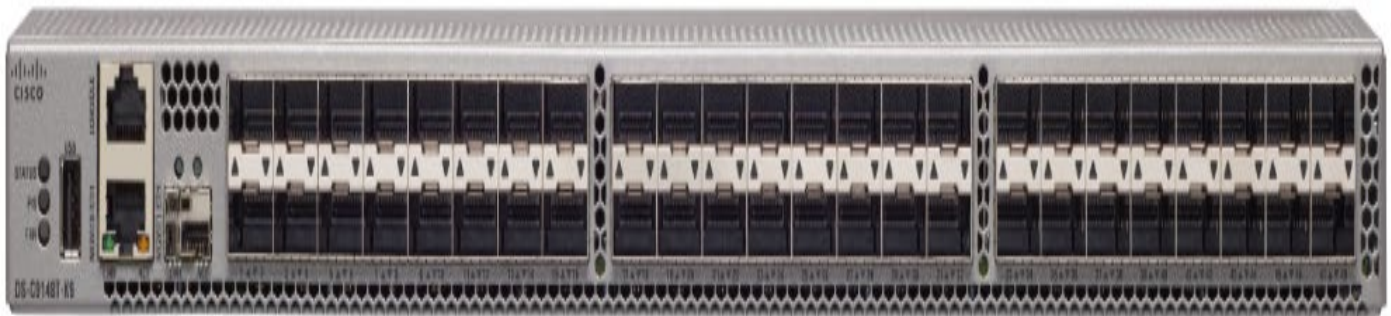
HPE Storage Fibre Channel Switch C-series SN6620C

The HPE Storage Fibre Channel Switch C-series SN6620C can be provisioned, managed, monitored, and troubleshot using Cisco Data Center Network Manager (DCNM), which currently manages the entire suite of Cisco data center products. Powered by C-series MDS 9000 NX-OS Software, it includes storage networking features and functions and is compatible with C-series SN8500C/SN8700C (MDS 9700) Series Multilayer Directors, C-series SN6610C (MDS 9132T) Multilayer Fabric Switches, C-series SN6010C (MDS 9148S) Multilayer Fabric Switches, C-series SN6630C (MDS 9396T) Multilayer Fabric Switches, C-series SN6710C (MDS 9124V) Multilayer Fabric Switches, C-series SN6720C (MDS 9148V) Multilayer Fabric Switches, and C-series SN6640C (MDS 9220i) Multi-service Fabric Switches, providing transparent, end-to-end service delivery in core-edge deployments.