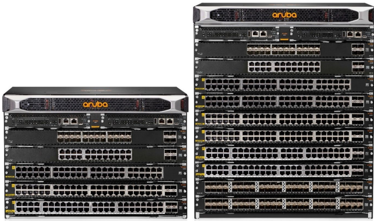
HPE Aruba Networking CX 6400 Switch Series

Dynamic segmentation extends HPE Aruba Networking's foundational wireless role-based policy capability to HPE Aruba Networking wired switches. What this means is that the same security, user experience and simplified IT management can be enjoyed throughout the network. Regardless of how users and IoT devices connect, consistent policies are enforced across wired and wireless networks, keeping traffic secure and separate.