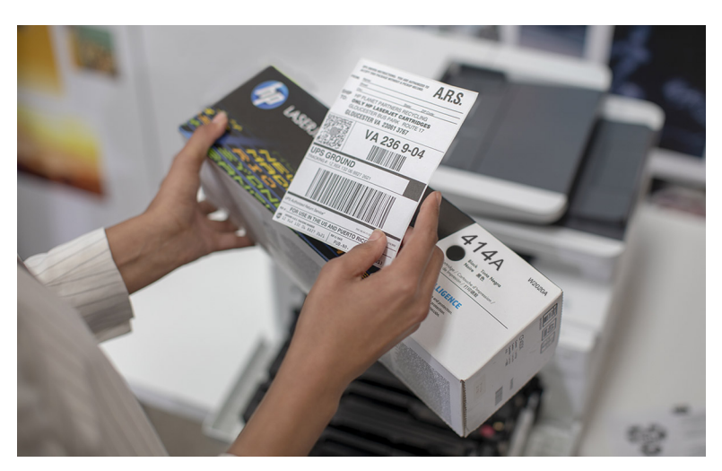
Find out more about HP Planet Partners<sup>24</sup> at <u>hp.com/recycle</u>

Count on easy cartridge recycling at no additional charge with HP Planet Partners.<sup>24</sup>