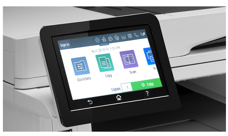
Customize frequently used tasks with Quick Sets feature<sup>3</sup>

Speed through print jobs right out of the box. This printer is shipped with preinstalled, specially designed Original HP LaserJet toner cartridges with JetIntelligence. Auto seal removal enables simple and seamless cartridge replacement, so you can get back to business fast—without costly delays or frustrating messes.