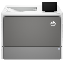
HP Color LaserJet Enterprise 5700dn Printer

This printer is intended to work only with cartridges that have a new or reused HP chip, and it uses dynamic security measures to block cartridges using a non-HP chip. Periodic firmware updates will maintain the effectiveness of these measures and block cartridges that previously worked. A reused HP chip enables the use of reused, remanufactured, and refilled cartridges. More at: http://www.hp.com/learn/ds