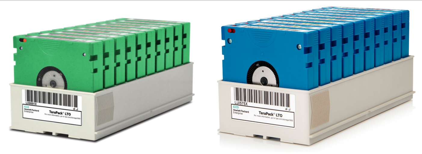
Spectra TeraPack Media

Spectra TeraPack Media is designed to make certain that customers have the most reliable and automated tape storage solution available. Our approach places the emphasis on ongoing enhancements and features that simplify virtually all aspects of the media management process.