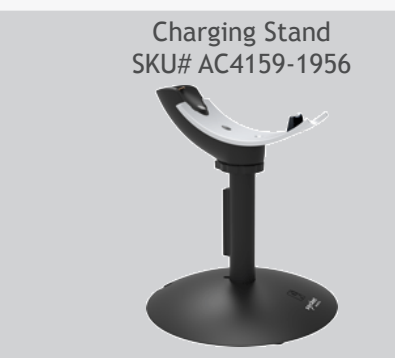
Great for using AutoScan Mode