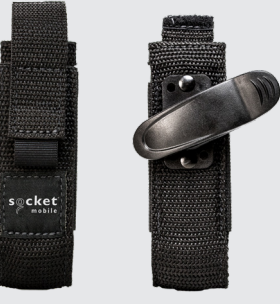
Safe and accessible placement