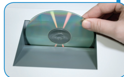
Optical media infeed