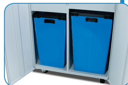
Lifetime guaranteed waste bins made of heavy-duty molded plastic

Formax - New Hampshire, USA www.formax.com