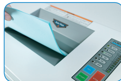
Separate infeed for paper, and user-friendly LED control panel

* Paper Shredder is designed ONLY for paper. No CDs, DVDs, Blu-ray discs, credit cards, staples, or paper clips.